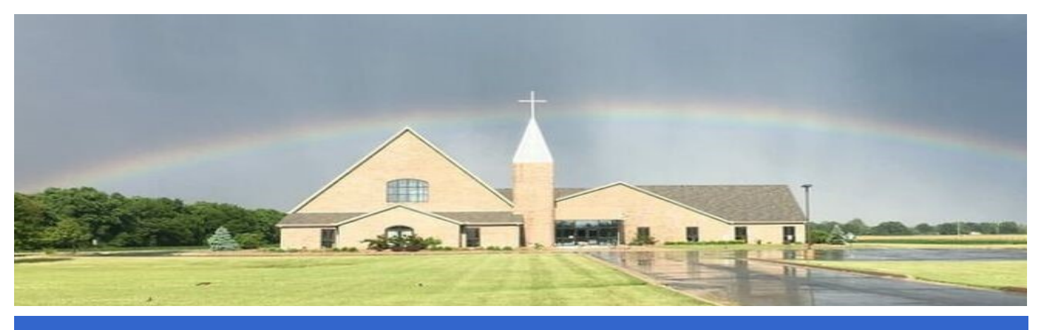
The people of St. Paul gather to worship, reach out, and serve the Lord.